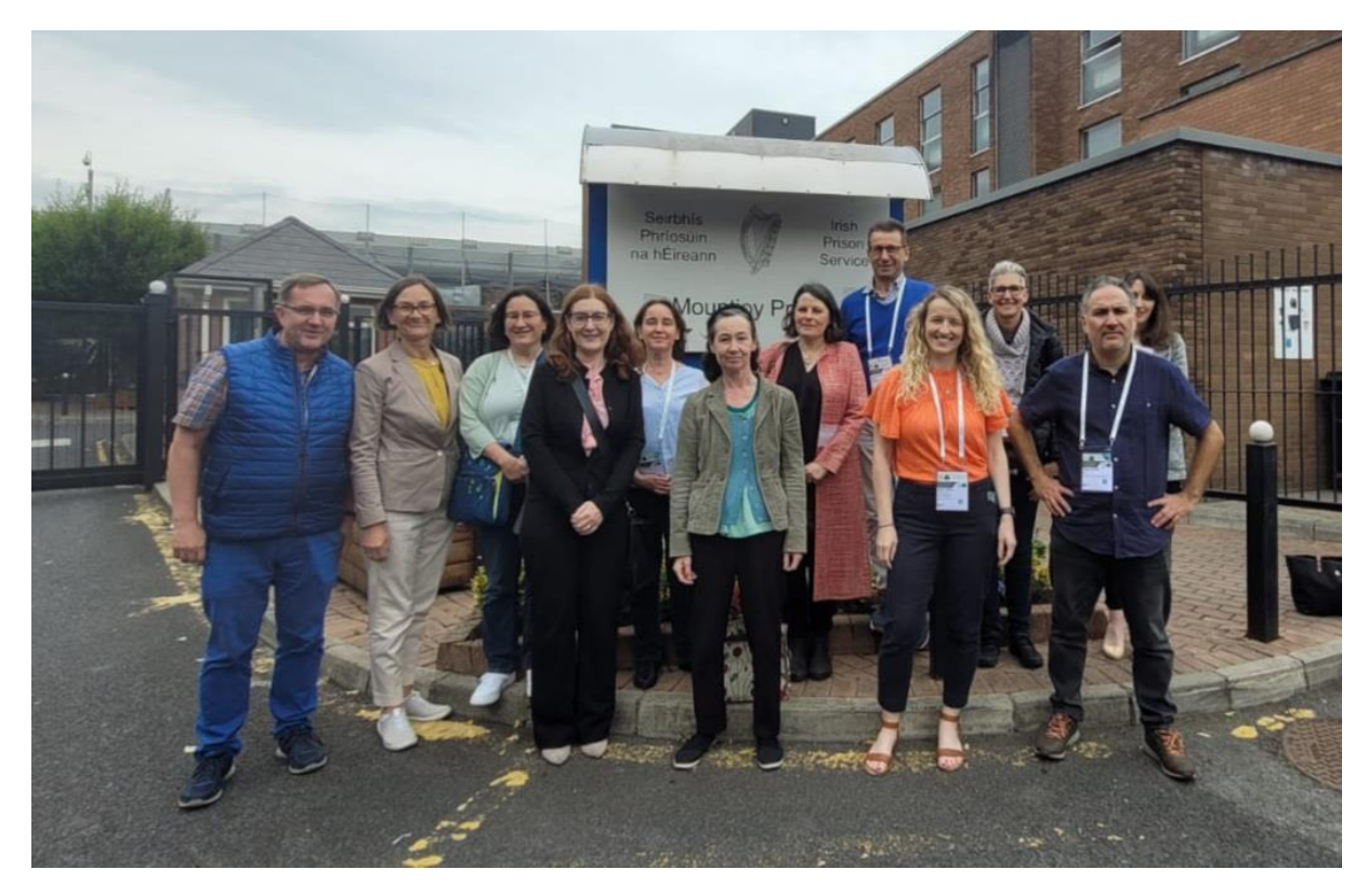
Description picture: group picture in front of Mount Joy Prison.

In the meantime, the 'IFLA Guidelines for library services to prisoners' were officially endorsed by IFLA. In the next months, we will share them with the global library community and during the poster session at IFLA WLIC 2023 in Rotterdam and support their translation!