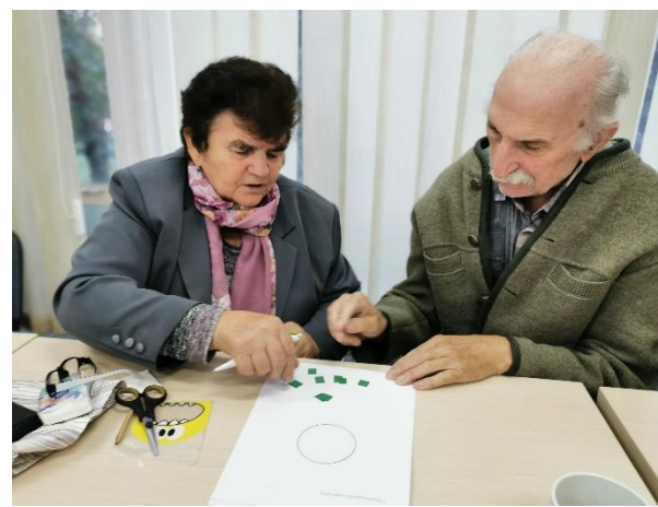
Description picture 1: workshop for librarians on bibliotherapy for senior citizens Description picture 2: brain aerobics workshop for senior citizens